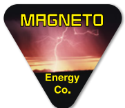
2 3/4" x 2 1/2" No. 119 Spot Color No. 3558 4-Color Process