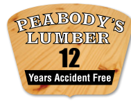
3" x 2 1/4" No. 115 Spot Color No. 3555 4-Color Process