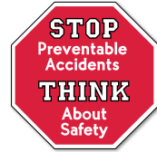
2 1/2" x 2 1/2" No. 121 Spot Color No. 3561 4-Color Process