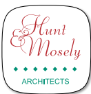
2" x 2" No. 120 Spot Color No. 3559 4-Color Process