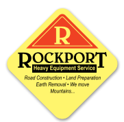
2.6" point to point (2" x 2" square) No. 111 Spot Color No. 3551 4-Color Process

Remember White is a color on clear material and is priced as an additional color on spot color, and is included on 4-color process decals. White is highly recommended to improve ink opacity and contrast. See the bottom of Appendix A for more information.