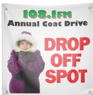
No. 1179 Custom Banners