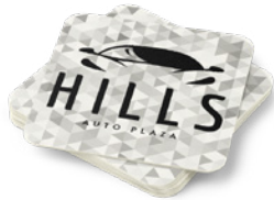
No. 1389 4" x 4" Square No. 1392 3 3/4" x 3 3/4" Square