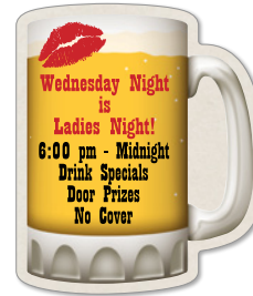
No. 1395 3 3/4" x 4 3/4" Mug