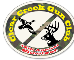
No. 1393 4 3/8" x 3 1/2" Oval