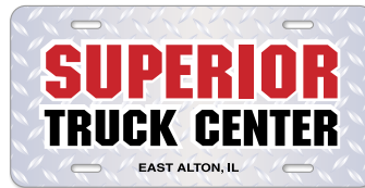
No. 317B Diamond Plate Finish