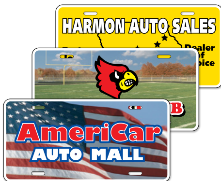
12" x 6" License Plates Full bleeds are not recommended.

There are no art charges for orders with approved digital art. Add $51.00(C) for artwork that does not meet specifications. See Appendix A for complete information.