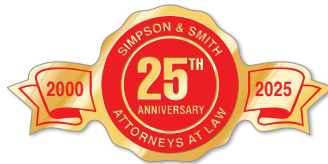
→ No. 1881 1 1/4" x 2 1/2"