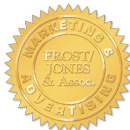
↓ No. 1883 2" dia.