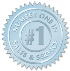
↓ No. 1882 1 1/2" dia.

Shown with Matte Background Shown without Matte Background