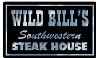
→ No. 1511 1 1/2" x 2 1/2"

Please identify repeat orders. No embossing die charge on repeat orders. Prices subject to change. MSRP shown. 6A-E