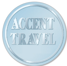
↓ No. 1113 2" dia.