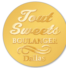
↓ No. 1061 1 1/2" dia.