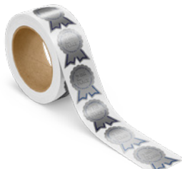
↓ No. 1884 1 3/8" x 1 1/4"